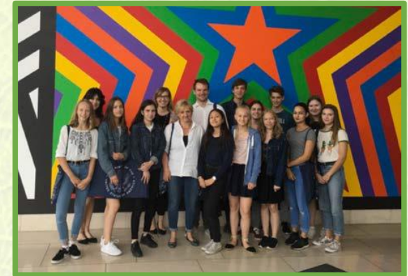
Going Green participants visit the US Embassy Berlin (2018)

How could we achieve a 100% renewable-energy transition?