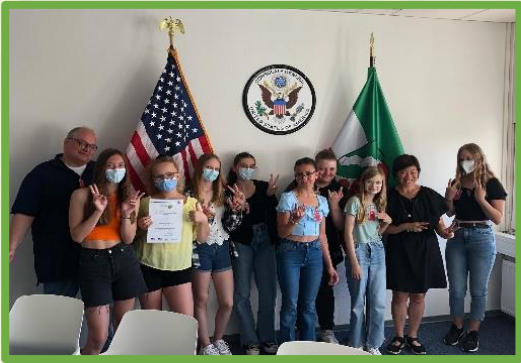
Students of Marie Curie Gymnasium in a memorable picture with the General Consul, Pauline Kao, at the General Consulate of the United States in Düsseldorf (2022)